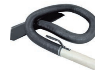
120154 3m Suction Hose Kit

This powerful wheeled vacuum with a 75cm working width and a powerful 500E Briggs & Stratton engine just doesn't stop – even wet or moist lawns and paths are no problem at all. An optional suction hose with nozzle accessories to get into the smallest corners to remove leaves and dirt is also available.